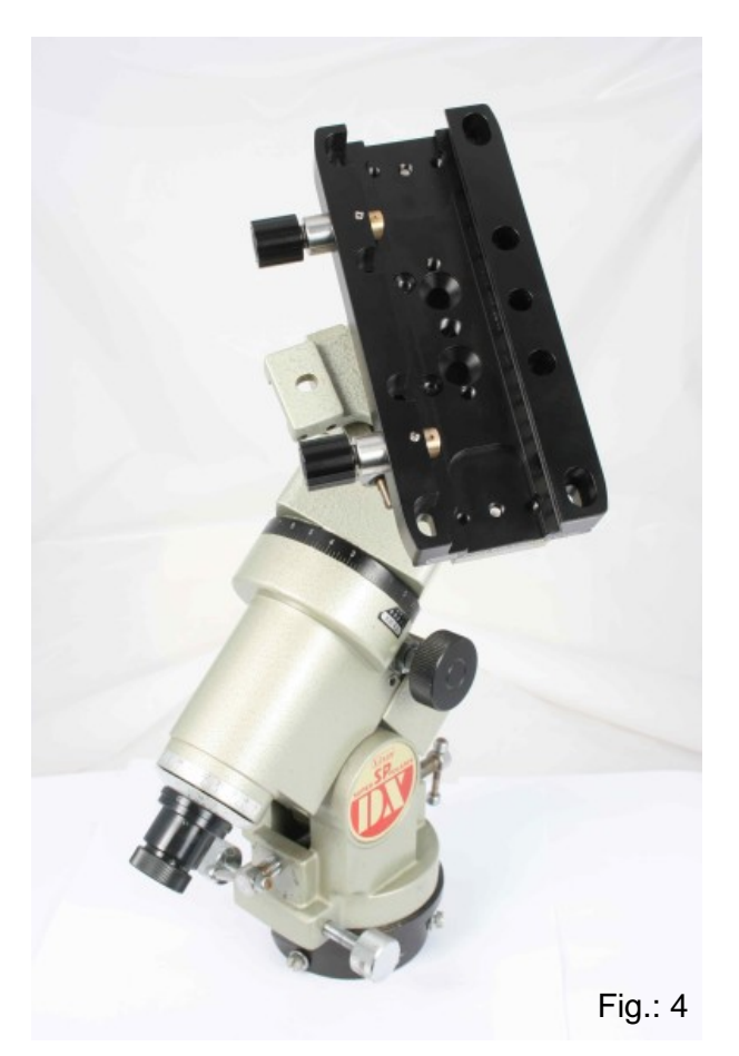
PAN EQ clamp 190 on Vixen mount