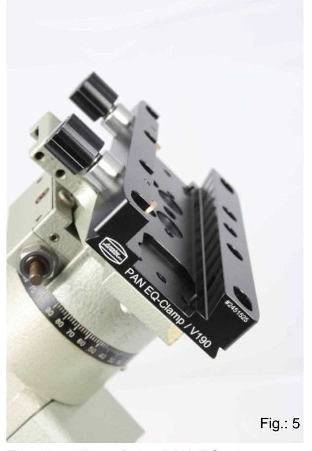
The rib milling of the PAN EQ clamp 190 multiplies the contact pressure of the two brass thrust clamps.