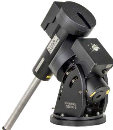
GM 3000 HPS 100 kg (220 lbs) load capacity