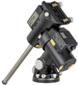
GM 1000 HPS 25 kg (55 lbs) load capacity