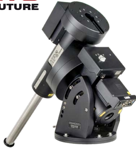
GM 4000 HPS II 150 kg (330 lbs) load capacity