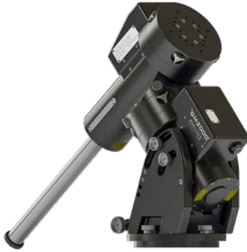
GM 2000 HPS II C 50 kg (110 lbs) load capacity